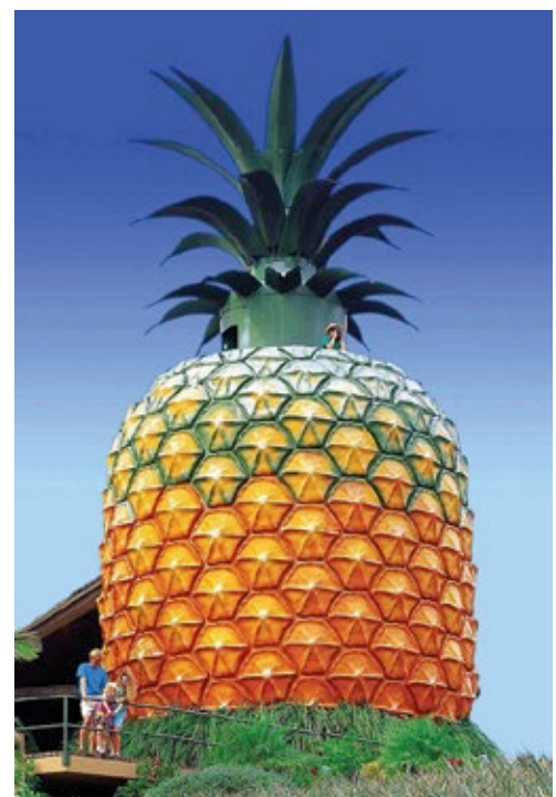
The Big Pineapple