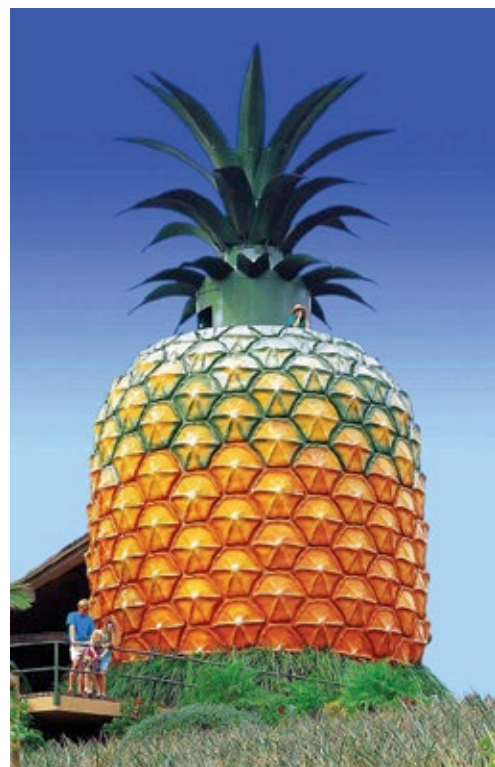
The Big Pineapple