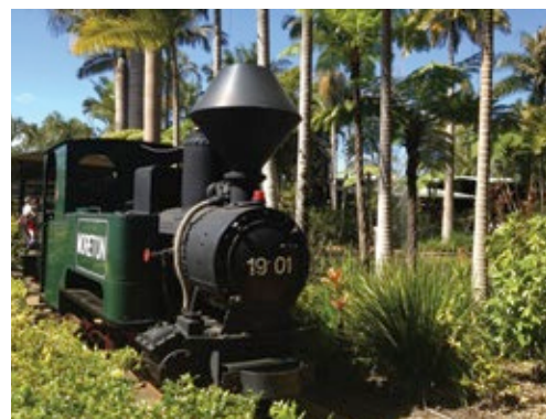
The Ginger Factory

Note: these listings are only suggestions and there are many other attractions in the area.